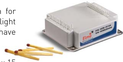
Hornet Intelligent Digital Servo Drive

The Hornet is very compact, measuring just 55 x 15 x 46.5 mm and weighing only 50 g. It has a peak output of 3.3 kW – 30 A at 100 V.