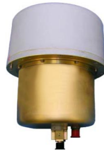
Figure 2: Aerial Vehicle Antenna