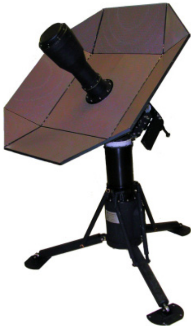
Figure 1: Ground Based Antenna

Ground-based and aerial antennas are used for surveillance and reconnaissance on foot and in the air. These systems are critical for successful field operations and for human safety. Most of these systems are deployed in desert and other harsh environments, adding the requirement for dependable and reliable operation to the already numerous challenges in these applications.