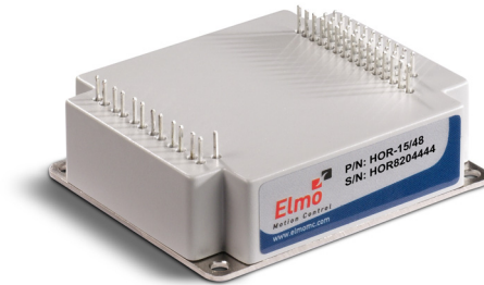
Figure 3: Hornet Intelligent Digital Drive

The Hornet digital drive was selected because it provides a compact form factor is rated suitable for extended environmental conditions and includes sophisticated on-board intelligence. The Hornet provides the most efficient and advanced servo control in a very compact package.