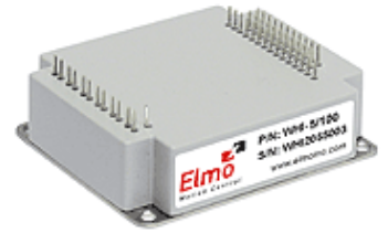
Whistle Intelligent Digital Servo Drive

The Whistle is very compact, measuring just 55 x 46.5 x 15 mm (2.2" x 0.6" x 1.8") and weighing only 50 g (1.8 oz). It has an output of 1.6 kW – 20 A at 80 VDC.